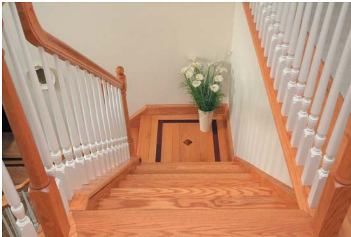
Contemporary Custom Home. Features a two-story foyer, Cherry in-lay carved wood staircase and French doors to a home office.

To find out more visit www.Bellamys.com .