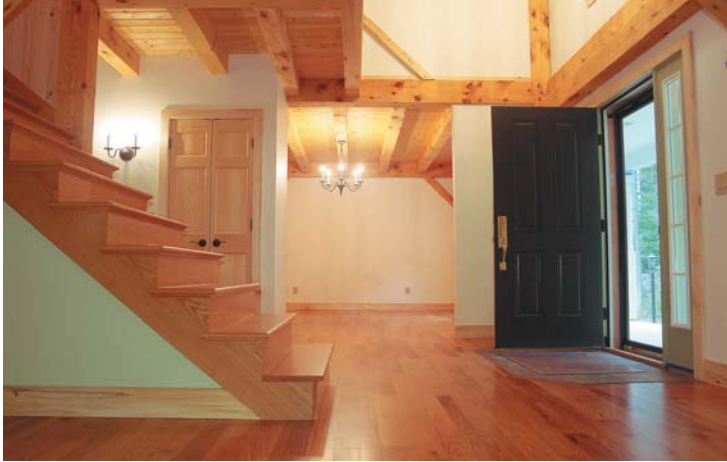
Timber Frame Custom Home, Glenville, N.Y. The wood used for the trim, casing and baseboards for this unique home was harvested from the property and milled on site. As an energy-savings effort the home was situated for southern exposure and spray-foam insulation was used.