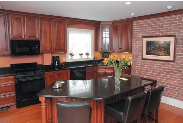
Addition/Kitchen Remodel, Scotia, N.Y. This historic home received an addition, adding an extra half bath, back entryway, family room and studio. The new custom kitchen boasts cherry cabinets with crown molding, under-cabinet lighting, granite countertops, and hardwood floors with custom inlay.